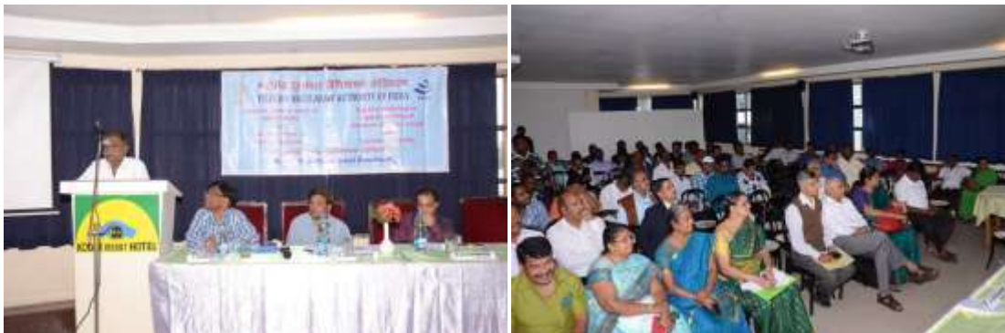
CoP at Kodaikanal, Tamil Nadu held on 29.07.2016

Full details of the Directions/Orders, Consultation Paper, Subscription Data, etc as mentioned in this newsletter are available on our website www.trai.gov.in