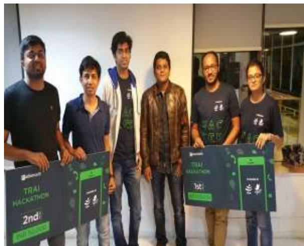
Hackathon Winning Teams

The concepts and technological solutions emerged from the Hackathon are under process with the objective of designing an efficient consumer complaint redressal system.