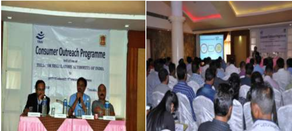
CoP at Tinsukia, Assam held on 28.07.2016