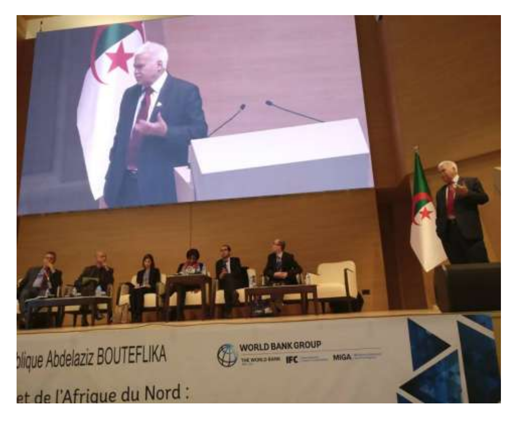
Chairman TRAI in Q&A session in Panel Session 3: Regulation as a Catalyst for Innovation at Algeria