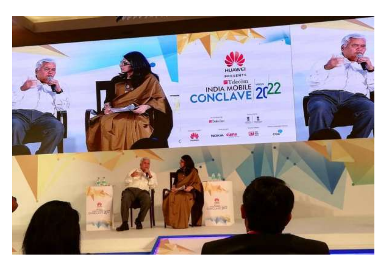
Chairman TRAI in a Q&A session, India Mobile Conclave 2018 at New Delhi.