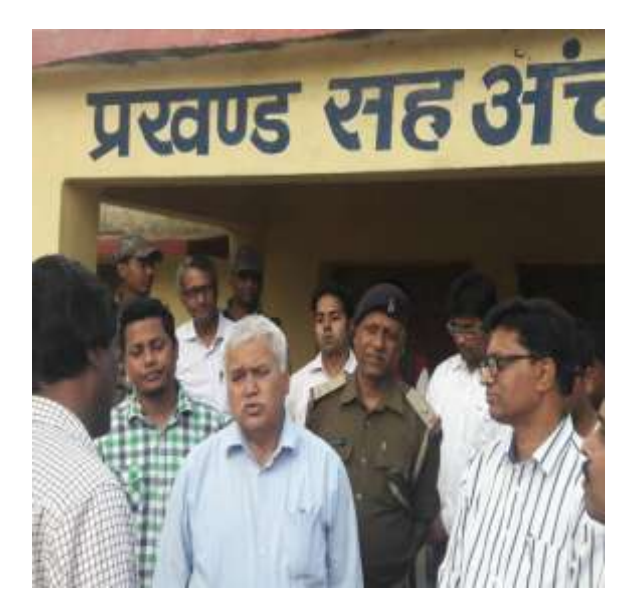
Chairman TRAI visited GPON installation under Bharatnet project at Kanke block and Arsande GP on 8th March 2018 and discussed operation and maintenance issues with BBNL and BSNL officers