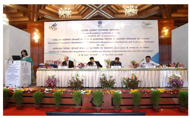
Page 13 of 17