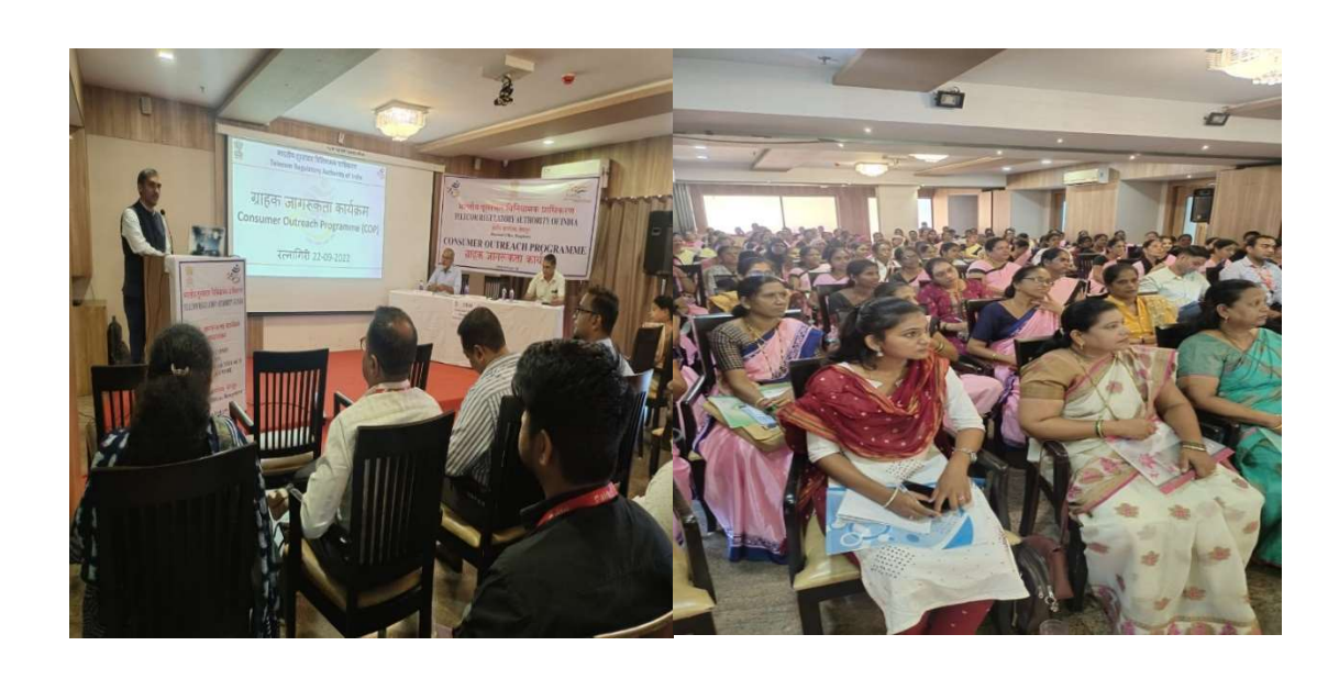
Special Consumer Outreach Program organized at Ratnagiri, Maharashtra held on 22<sup>nd</sup> September 2022 specially Anganwadi sevikas by Regional Office, Bangaluru