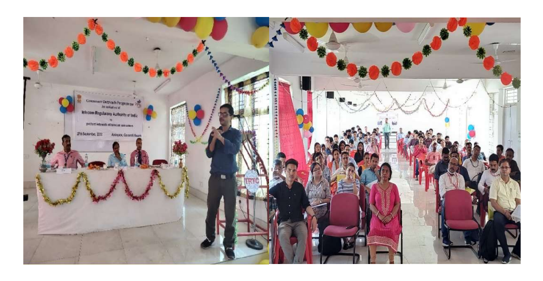
Consumer Outreach Program at Amingaon, Guwahati (Assam) held on 27<sup>th</sup> September 2022 by Regional Office, Kolkata

Secretary, TRAI, New Delhi was addressed at the Special Consumer Outreach Programme for farmers & agricultural students at Tamil Nadu Agricultural University (TNAU), Coimbatore (Tamil Nadu) on 23<sup>rd</sup> September 2022