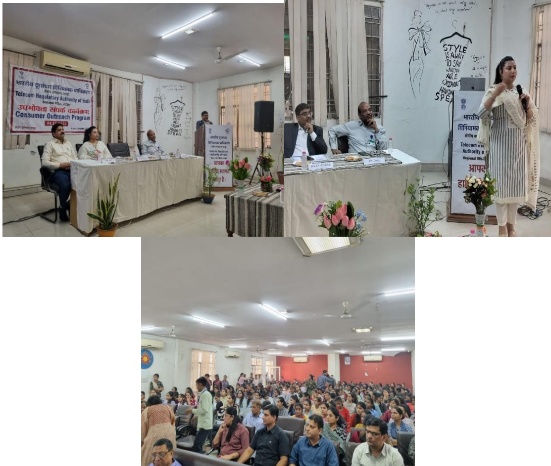
Special COP for women students at Govt Women polytechnic Sanganer, Jaipur on 4 th November 23 by RO Jaipur