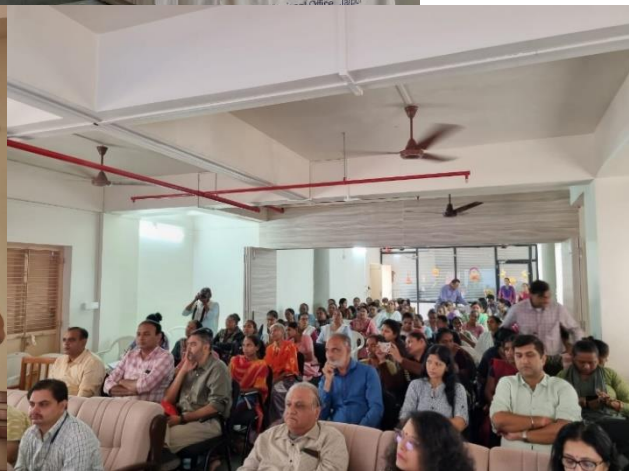
Special Consumer Outreach Programme for Women SEWA Gujarat members at Anand District on 29 th November 23 by RO Jaipur