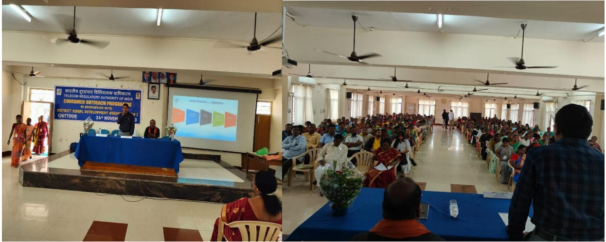
Consumer Outreach Program at Chittoor (AP) for Women on 24 th November 23 by RO Hyderabad