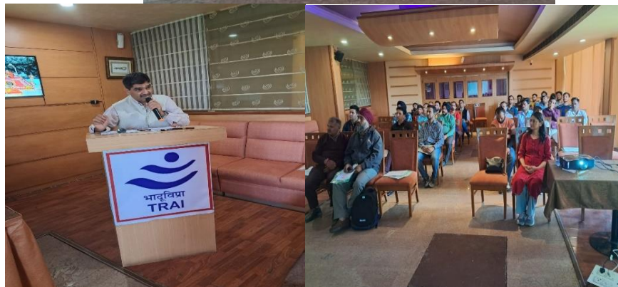
Consumer Outreach Program at Katra (J & K) on 1 st November 23 by TRAI, Hqrs New Delhi