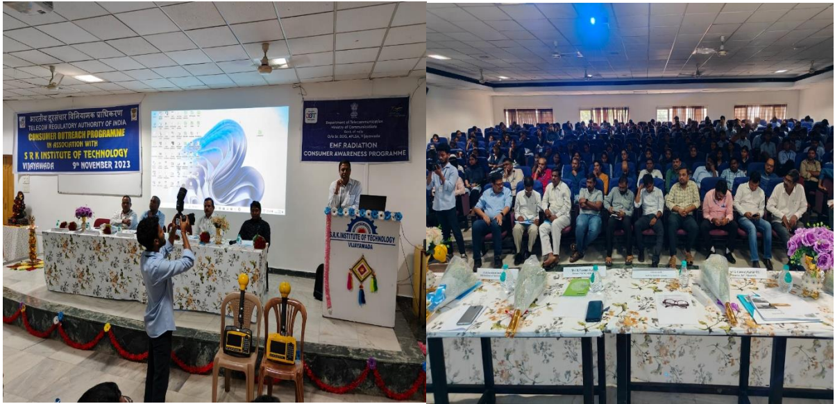
Consumer Outreach Program at Vijayawada (AP) on 09 th November 23 by RO Hyderabad