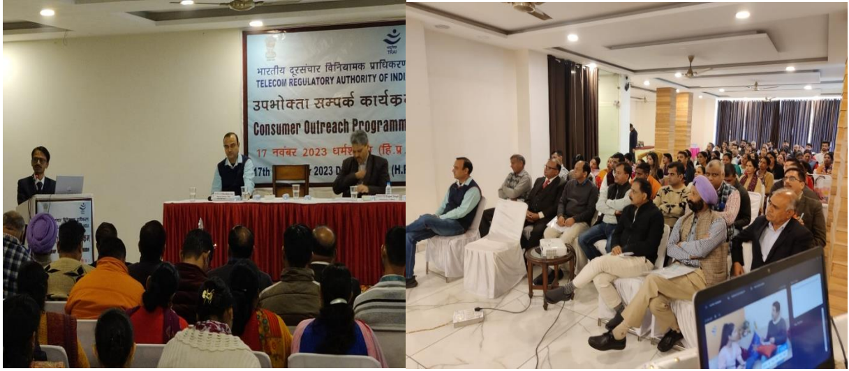
Consumer Outreach Program at Dharmshala conducted by TRAI HQ, New Delhi on 17 th Nov. 23