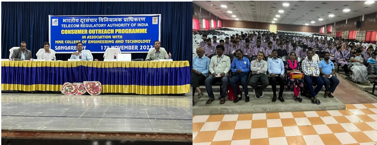
Consumer Outreach Program at Sangareddy, Telangana on 17 th November 23 by RO Hyderabad