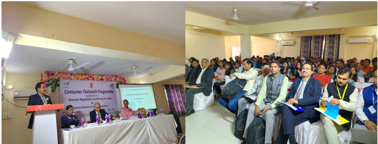
Consumer Outreach Program at Rajgir (Bihar) on 24 th November 23 by RO Kolkata