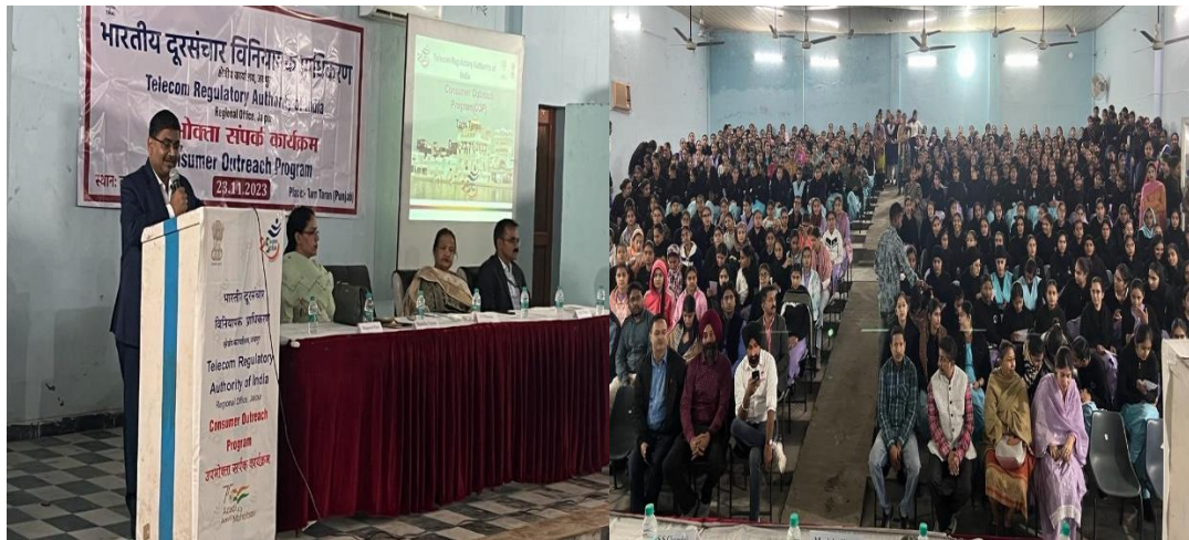
Special Consumer Outreach Program was organised for Women on 23 rd November 23 by RO Jaipur. In this programme Women officer called as cyber expert from Punjab Police at Tarn Taran (Punjab)