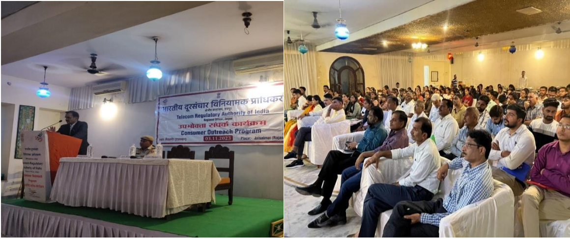
Consumer Outreach Program at Jaisalmer (Rajasthan) on 3 rd November 23 by RO Jaipur