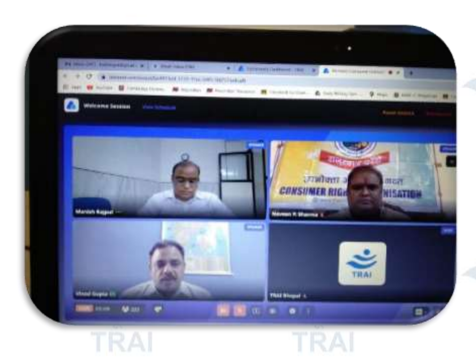
CoP for Madhya Pradesh held on 29th October 2021

Full details of the Directions/Orders/Consultation Paper/Report, Subscription Data, etc mentioned in this newsletter are available on TRAI website <a href="www.trai.gov.in">www.trai.gov.in</a>