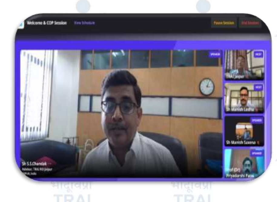
CoP for Rajasthan held on 29th October 2021